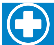
Clean and disinfect