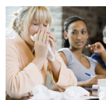
Exposure to airborne infectious agents